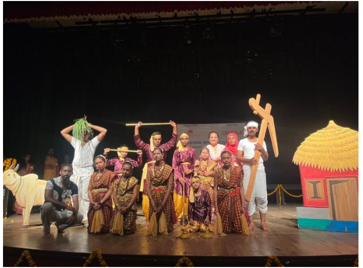
22/11/2025 Brown day was celebrated at School.